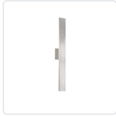
AT7928-BN Brushed Nickel